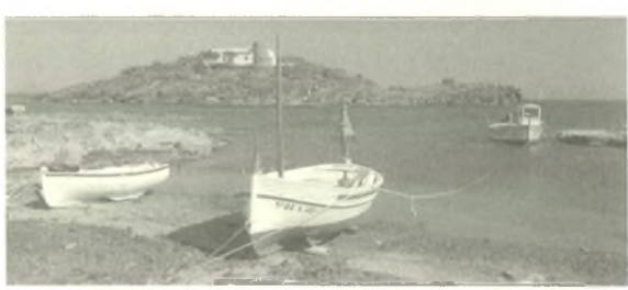
Spain, Costa Brava, Cadaques: great diving spot near Arenella Isl.