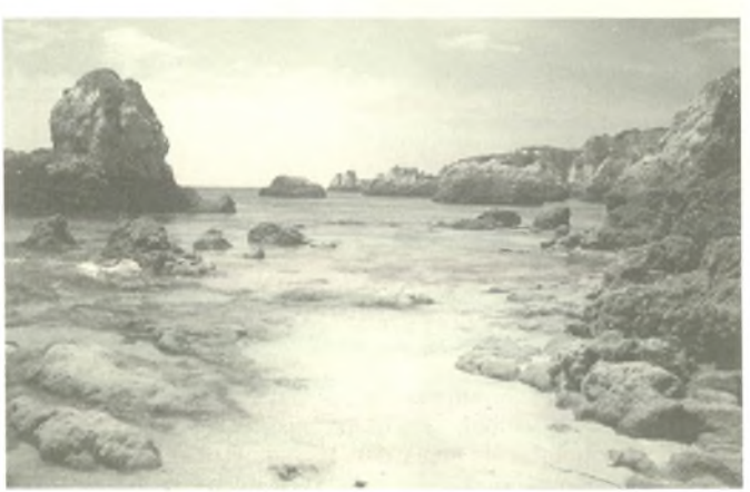
Rocky shore at Praia de Rocha, Algarve, Portugal