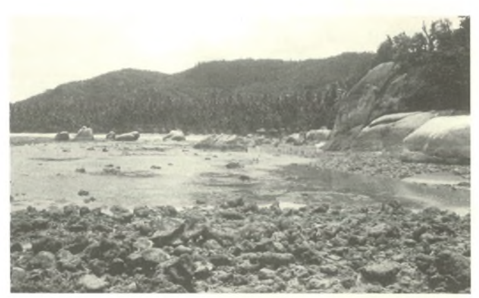
Attractive sand flat with stones at Lamai Beach, Koh Samui, Thailand

Wanted: recent brachiopods; all species from all countries welcome. Many mollusc species available for exchange.